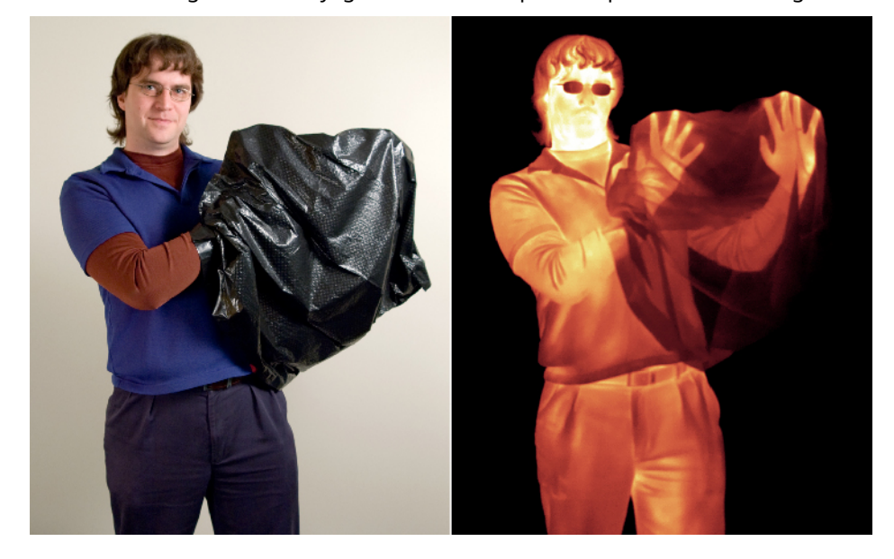
Figure 6.15 Infrared Eyes. Infrared waves can penetrate places in the universe from which light is blocked, as shown in this infrared image where the plastic bag blocks visible light but not infrared.

Typical temperatures on Earth's surface are near 300 K, and the atmosphere through which observations are made is only a little cooler. According to Wien's law (from the chapter on Radiation and Spectra ), the telescope, the observatory, and even the sky are radiating infrared energy with a peak wavelength of about 10 micrometers. To infrared eyes, everything on Earth is brightly aglow—including the telescope and camera ( Figure 6.15 ). The challenge is to detect faint cosmic sources against this sea of infrared light. Another way to look at this is that an astronomer using infrared must always contend with the situation that a visible-light observer would face if working in broad daylight with a telescope and optics lined with bright fluorescent lights.